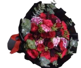
Madly in Love