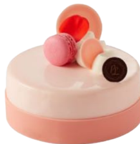
Rose Strawberry Cheesecake